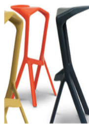
Miura Barstool, K. Grcic, Plank Collezioni

3. What are, in your opinion, the three key words which identify a good product design in the present overview? Simple, functional and emotional.