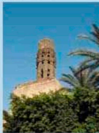
The great impressions of El Baz area and the rehabilitated spaces press lounge hotel.

Esta é a primeira das três edições anuais, resultado da aposta do governo e da cidade na divulgação dos seus designers aliados a empresas de renome internacional. As imagens que apresentamos mostram os vários cenários criados e um pequeno hotel transformado em press lounge. Uma iniciativa exemplar, que merece ser analisada com atenção pelas nossas instituições. #