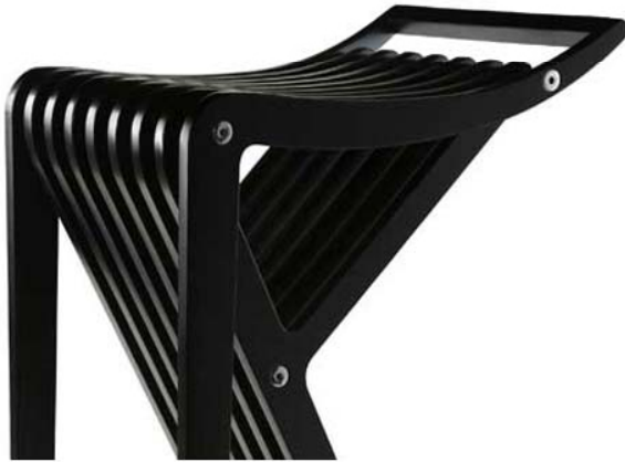
Utchat stool by Rami Makram for &Cairo.