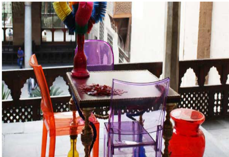
Dina Shoukry's table was installed in the "Smoking Room."

By Heba Elkayal/Daily News Egypt June 18, 2010, 5:08 pm